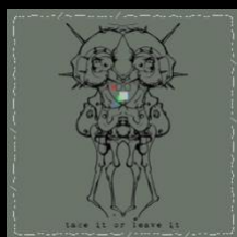
take it or leave it