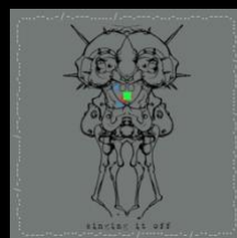
singing it off